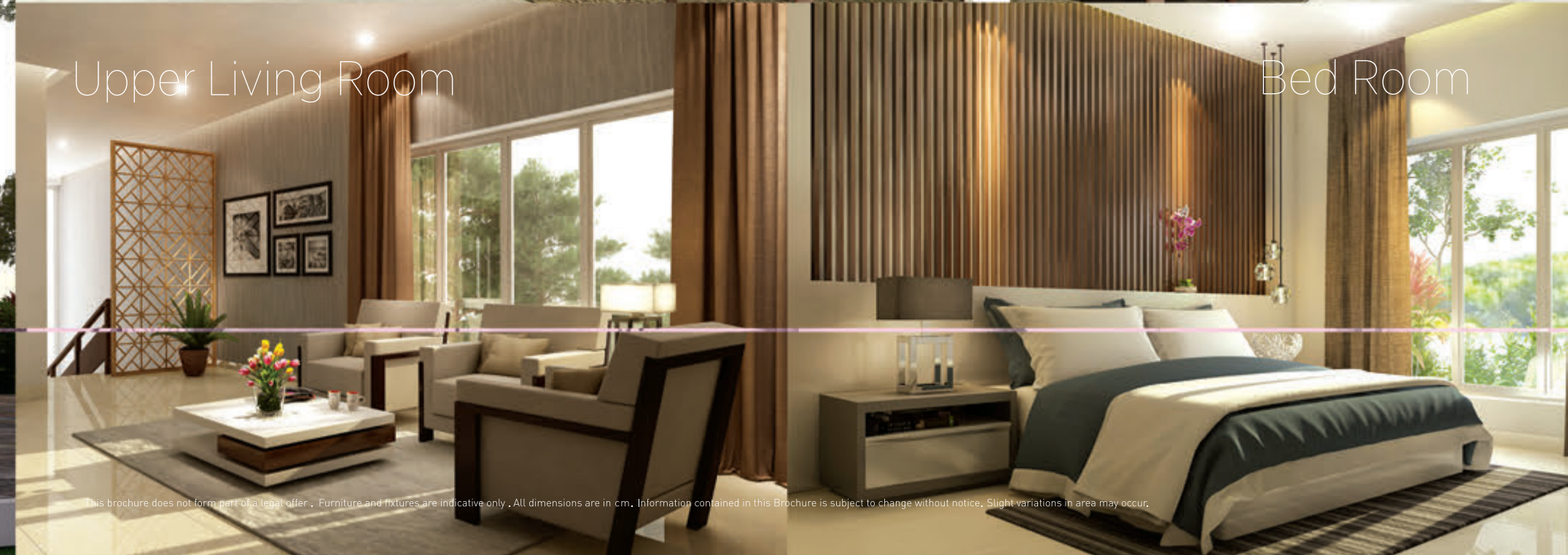
Upper Living Room