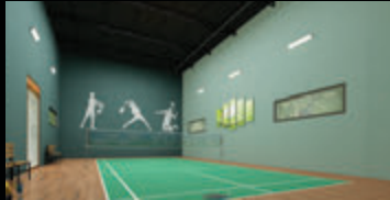
Indoor Shuttle Court