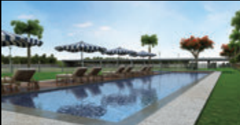
Open Swimming Pool