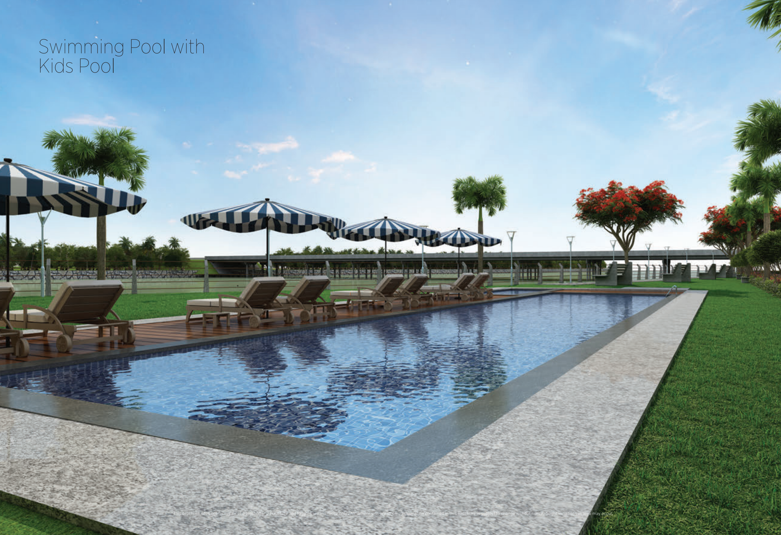
Swimming Pool with Kids Pool

This brochure does not form part of a legal offer. Furniture and fixtures are indicative only. All dimensions are in cm. Information contained in this Brochure is subject to change without notice. Slight variations in area may occur.