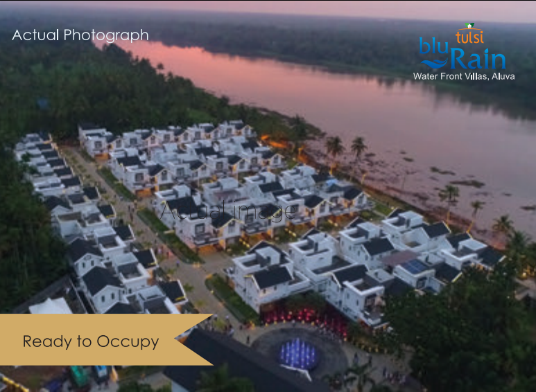
Ready to Occupy